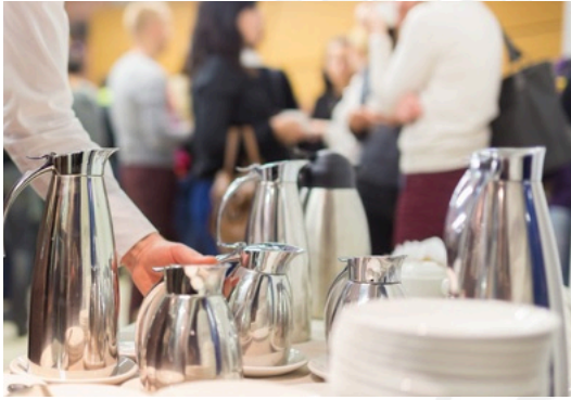
Plate Served Golfer's Special Breakfast $21