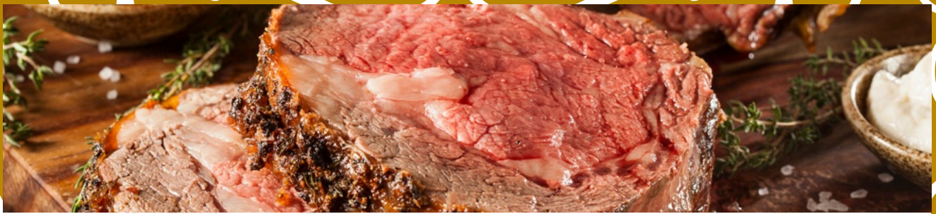
Plate Served Dinner Selections Continued...