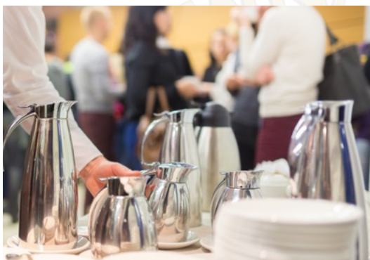
Plate Served Golfer's Special Breakfast $19