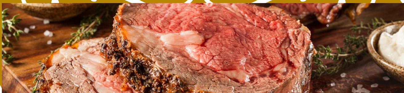
Plate Served Dinner Selections Continued...